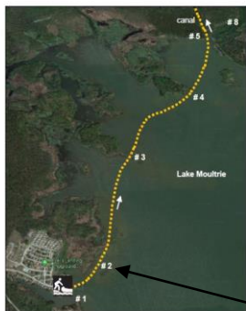
Map 1 of 2 - Santee Canal N. Moultrie

This map corresponds with route directions numbered 1 - 5, and 8.