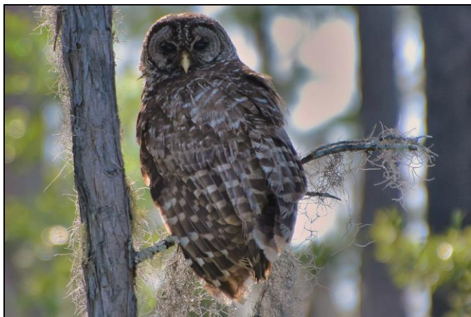
Barred Owl in Dennis's Pasture near the dike system on Lake Moultrie.