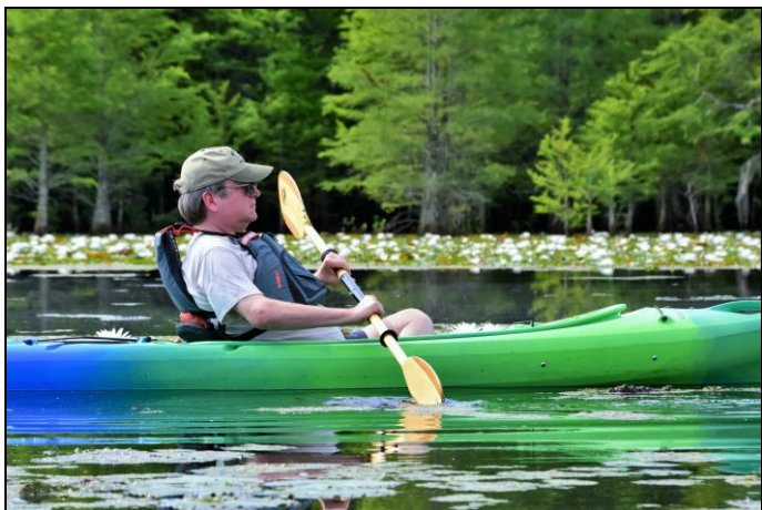
You'll paddle by acres of lily fields in the warmer months.